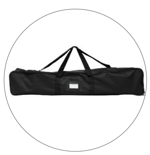
Qty 1 - Carry Bag