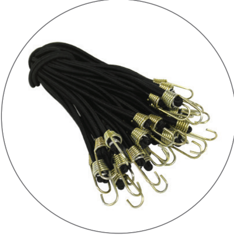
Qty 28 - Bungee Cord w/ Hook