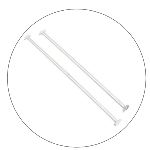
Qty 2 - Support Tubes