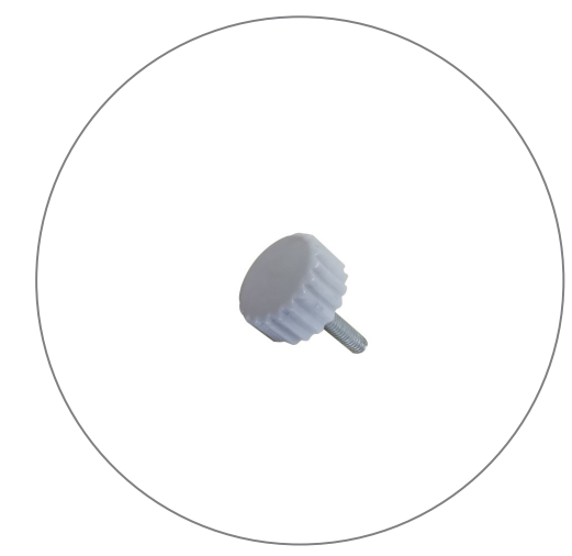
Qty 2 - Screw Knobs