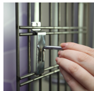
Recommended hook style shown