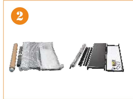
2. Take all the Components out of the bag.