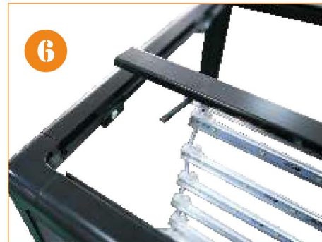
6. Hang the lights like this