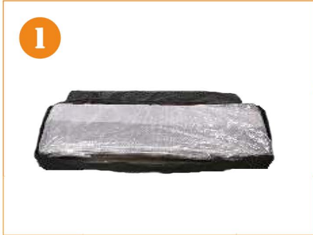
1. All of the components of the LBC1G are enclosed in the soft carrying case.