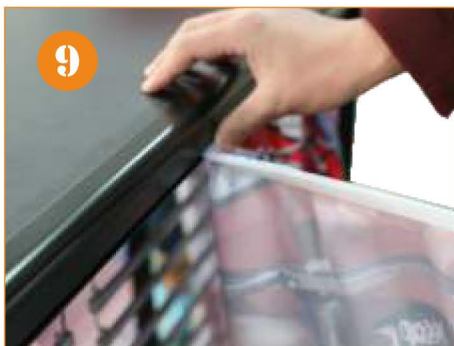
9. Install the graphic with silicon