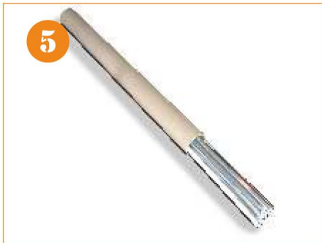
5. Take out the LED light