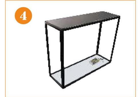
4. Put the top whole pcs on the 4pcs poles