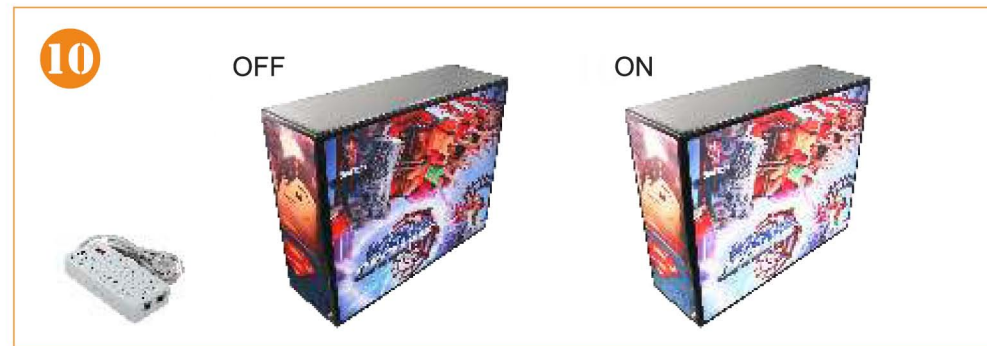
10. The finished light box should look like this