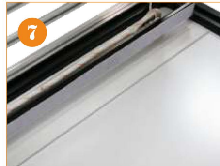
7. Attach the bottom aluminum bar's male to the velcro on the base