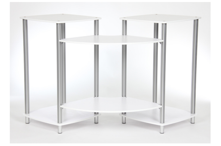
5) Place middle bridge sections on gussets and attach with bolts and weld nuts.