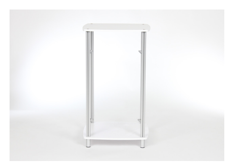
3) Secure top shelf to poles with bolts or optional caps. If locking doors are purchased, insert them as you attach top shelf by sliding door pegs into holes in shelves.

2) Once all four poles and feet are attached to bottom shelf place counter section upright.