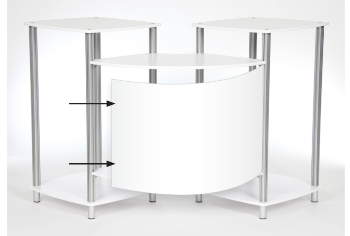
6) Once all shelves are secured, insert panels by applying tension.