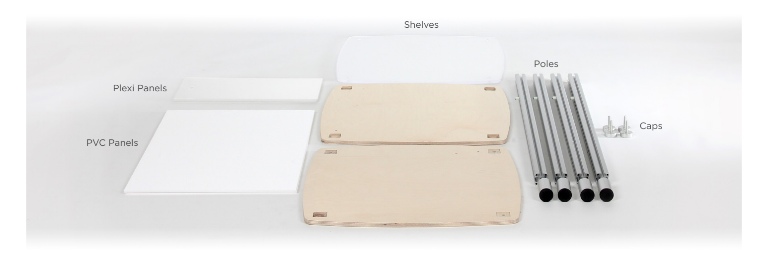
Build counter from the bottom up.