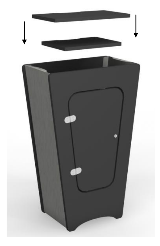
Step 8: Reaching through the door; Lower the counter top into position and secure with (2) Long Knobs