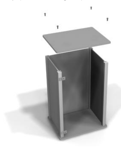
Step 3. Attach top using four M12 bolts. Tighten w/ 8mm hex key. ( do not over tighten )