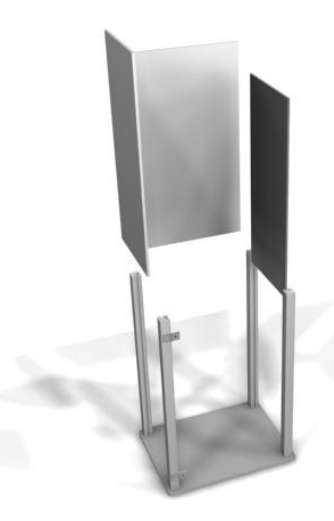
Step 3. Attach top using four M12 bolts. Tighten w/ 8mm hex key. ( do not over tighten )