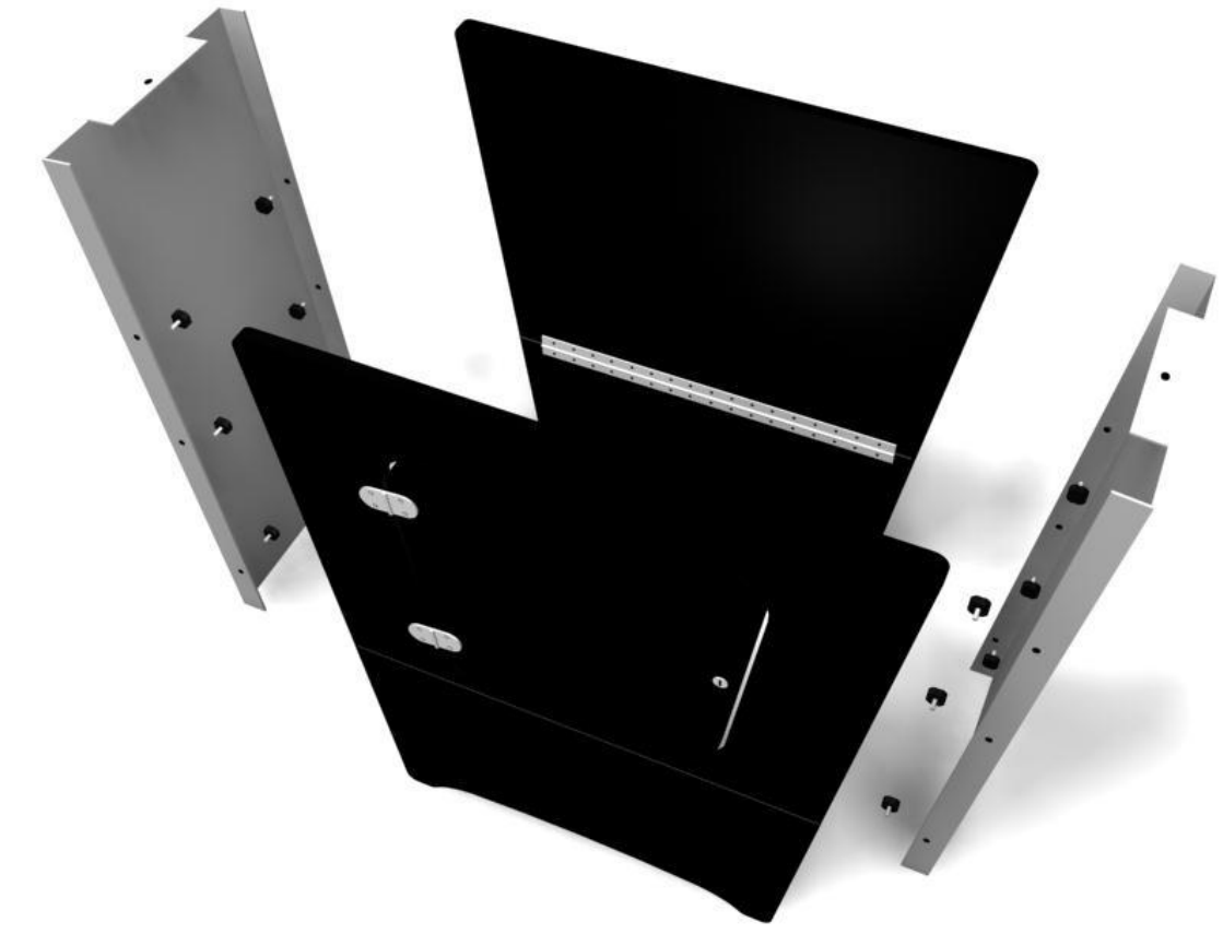
Step 2: Lower shelves on to knobs.

Step 1: Attach back & front to sides using 12 short knobs.