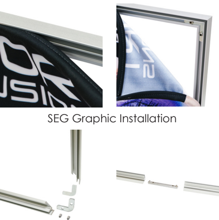
SEG Graphic Installation