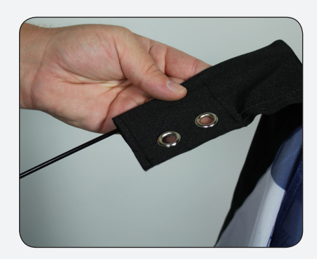
Step 4 After the pole has been assembled, slide the pole through the graphic's pole insert all the way through.

Starting with the largest pole containing the stretchable string insert the Silver end into the next largest poles close off end and repeat for other poles closed off end into the open end of the last pole.