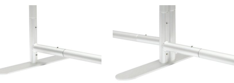
Single foot connection