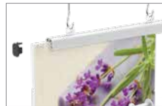
UCSP Aluminum Screw Posts, set of 2. Slide graphic 3/8" max. thick into casing.