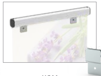
UC44 Wall Mount Kit for SN1 & SN2 Set of 4.