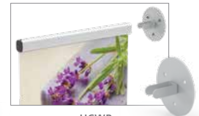
UCWB Wall Mount Bracket - set of 2, 3-1/4" diameter. For 36" maximum. Indicate -B Black or -S Silver