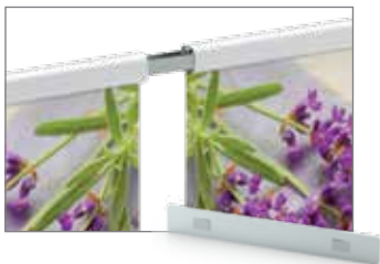
UC180 Steel Brackets Set of 4. Allows casings to be joined in series.