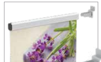
UCSWB Slatwall bracket - set of 2 for 36" max. Perpendicular to wall.