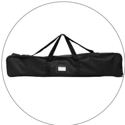
Qty 1 - Carry Bag