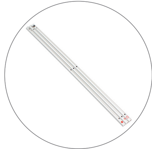
Qty 3 - 39.25" Tubes