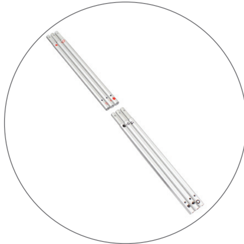
Qty 6 - 19.75" Tubes