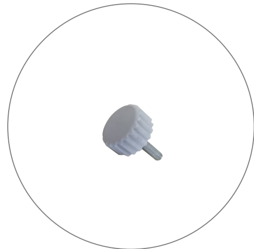
Qty 2 - Screw Knobs