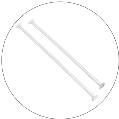
Qty 2 - Support Tubes