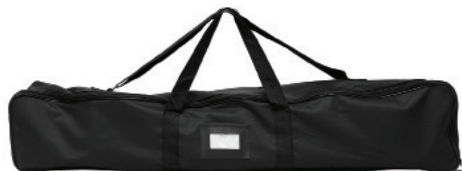
Nylon Carry Bag