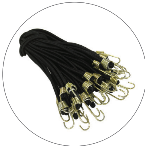
Qty 28 - Bungee Cord w/ Hook