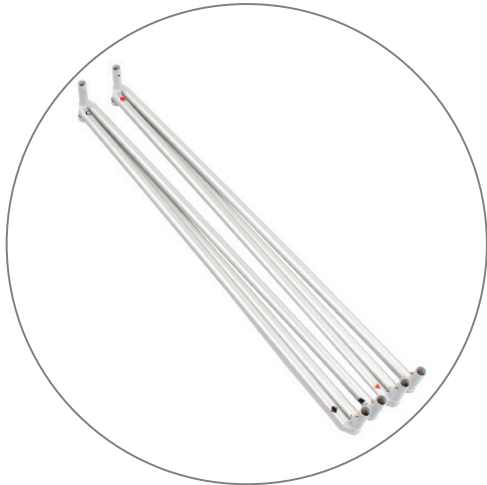
Qty 2 - Triangular End Tubes