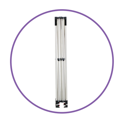
QTY 1: Frame w/ Pre-Installed Graphic

Outside Dimensions: • 11" L × 11" W × 62" H Inside Dimensions: • 10 1/2" L × 10 1/2" W × 61" H