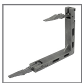
Vail Tool Free Corner Connector (QTY: 4)