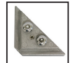
Triangle Lock (Qty: 4)