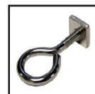
*Ceiling Eye Hook