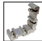
Vail Corner Connector (Qty: 4)