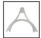
Yeti Feet (Qty: 2)