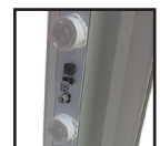
*Resort Light Strip (Qty: 8)