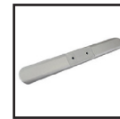
Vail Feet (Qty: 2)