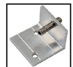
*Wall Mounts (Qty: 4)