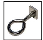
*Ceiling Eye Hook