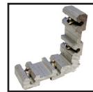
Vail Corner Connector (Qty: 4)