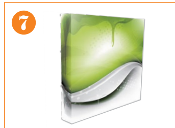
7. Completed Salto frame with graphic.