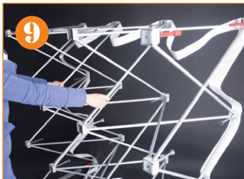
9. Close the frame and put into the case.