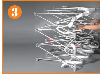
3. Open the frame up.