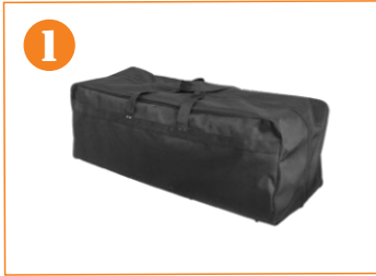
1. Salto soft bag.