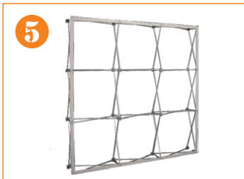
5. Completed Salto frame.