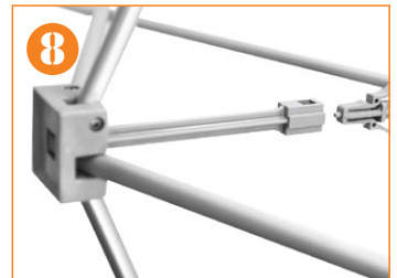
8. Remove the graphic and unfasten ALL plastic connectors