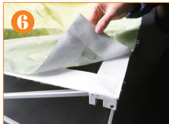
6. Lay the frame on the ground and install the graphic.