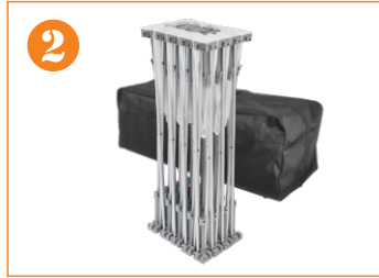
2. Take out the frame from the bag.