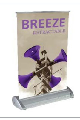
Unit is complete.