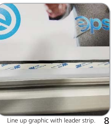
Line up graphic with leader strip.