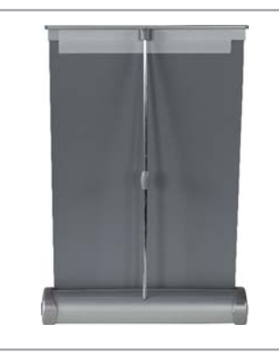
Unit is complete. Back view. 12