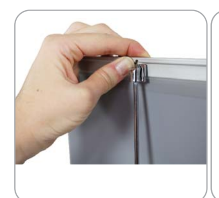
Pull up graphic and secure to poles. 11