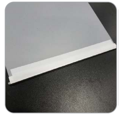
Take the re-enforcing tape and apply 6 Have banner stand upside down. This 7 to the back of the banner and rail making sure there is even coverage between the two.