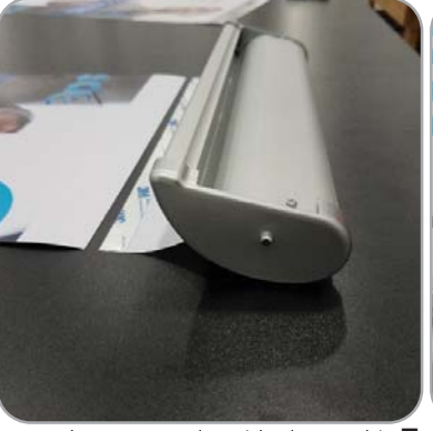
keeps leader strip from curling up.