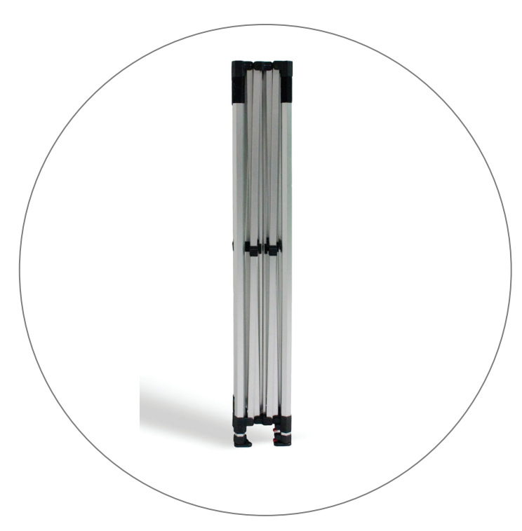
(qty 1) Canopy Frame