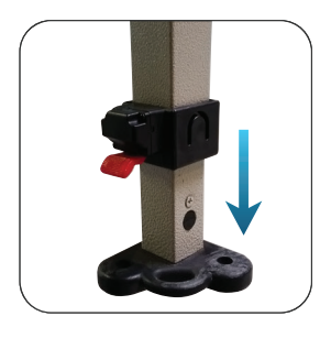
Step 8 The install is complete.