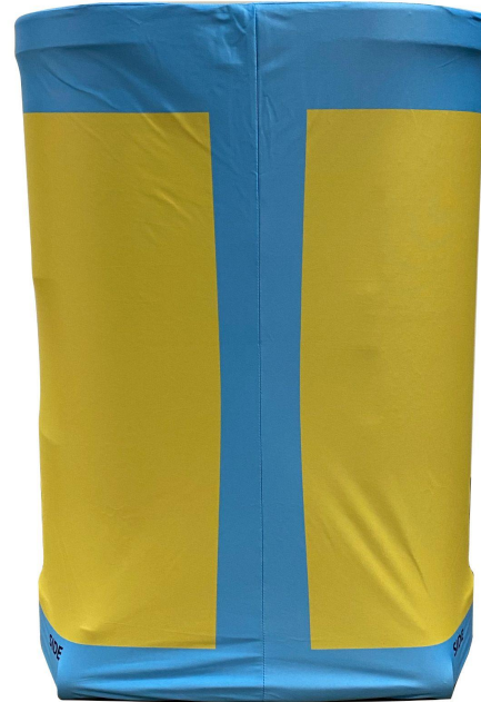
Back of Podium Graphic