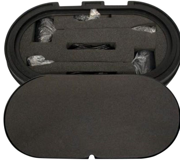
Storage area inside lid *Lights not included