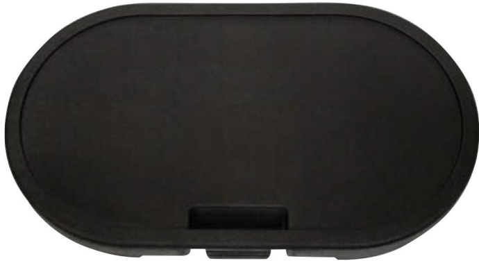
Top of case lid