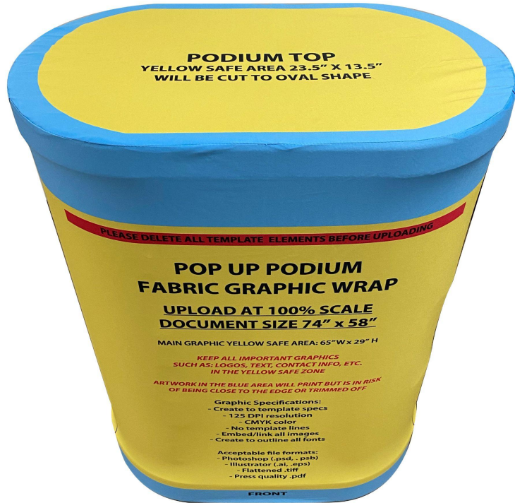
Top of Podium Graphic