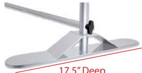
17.5" Deep Sturdy Steel "Bridge" Support Base.