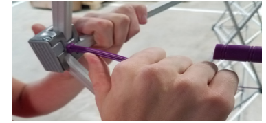
M2. Loosen the male arm by wiggling side to side and remove by pulling to one side.