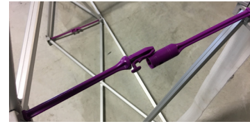
M1. Unbuckle the male and female arms then gently tilt either arm up or down.