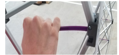
F2. Remove the female arm as in M2.; wiggle side to side and pull out to one side .