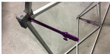
1. Insert the male arm into the frame hub.