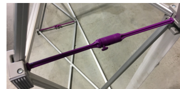
3. Line up the female arm to the frame hub (3A.) and push into place (3B.).