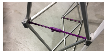
5. The unit is assembled.