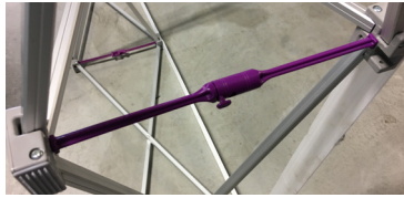
1. The unit starts together.