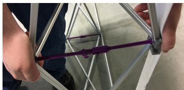
3B. Lock the arm into place by pushing the two sides of the frame together.