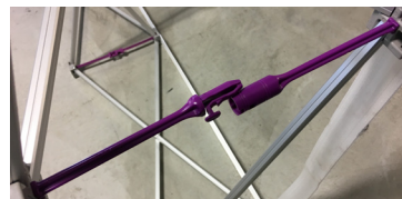
2. Insert the female arm into the frame hub.