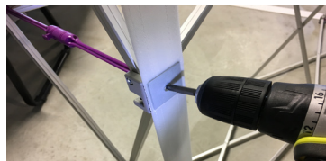
4. Secure the female arm by screwing the plate to the frame hub.