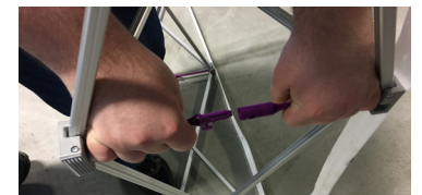
3A. Make contact when lining up the female arm and the frame hub for easier connection.