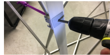
F1. Unscrew the plate and female arm from the frame hub.