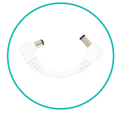
QTY 6: LED Wire Connector