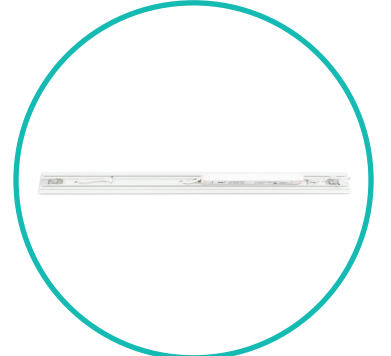
QTY 3: Bottom Frame Piece