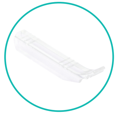
QTY 18: Connection Clips