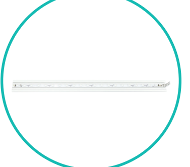
QTY 12: Side Frame Pieces