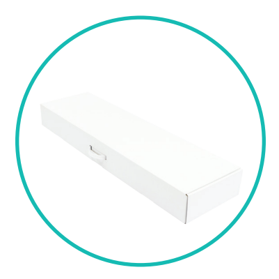
QTY 3: Box Case

Outside Dimensions: • 45" L x 12 1/2" W x 5" H Inside Dimensions: