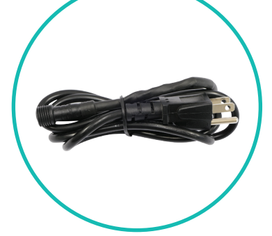
QTY 3: Transformer Power Cord